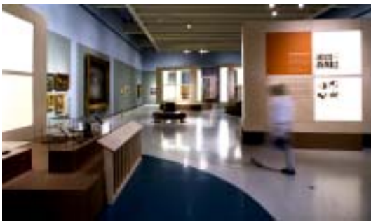
Carnegie Museum of Art Fierce Friends Exhibition

SPRINGBOARD Architecture Communication is a multi-disciplinary architectural firm dedicated to the development of museums and cultural facilities such as libraries, community centers and university buildings.