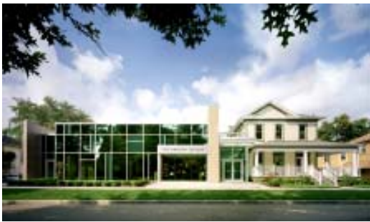
The Maridon Museum

SPRINGBOARD's mission is to help its clients 'springboard' their visions. To do this, SPRINGBOARD's designers collaborate with their clients to stimulate, inspire, create and produce new architecture, clear communications, and innovative designs.