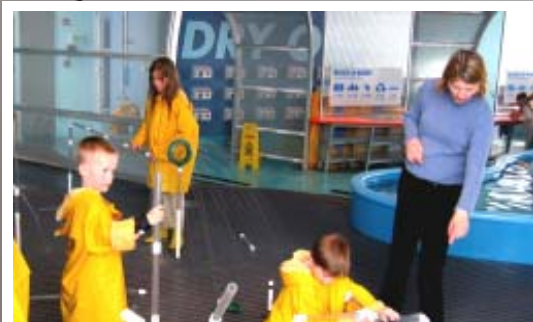
Children's Museum Pittsburgh Waterplay Exhibition